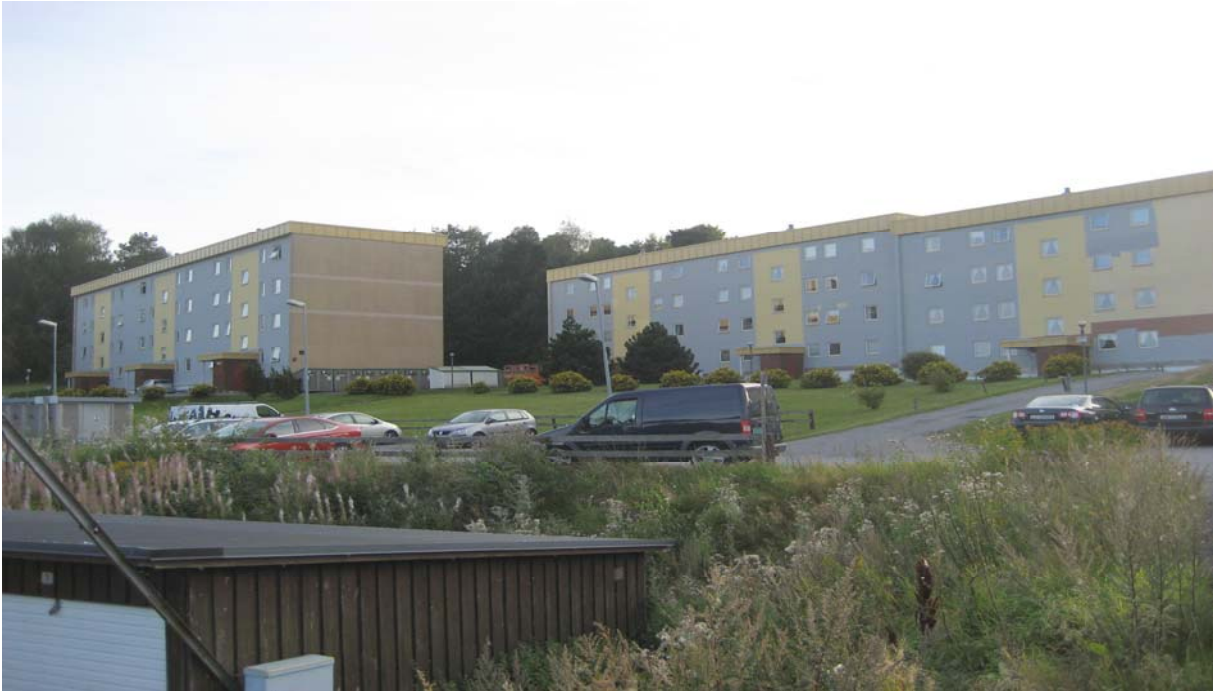
Sixteen houses blocks in Tjølling with FRP cladding panels seen from north/east. Picture taken in august 2013.